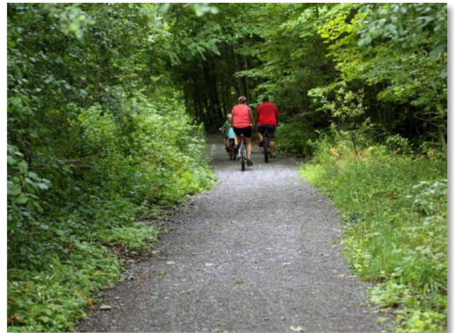
Biking on the Lakeview Trail, Image 15-9726

If you miss the broadcast, we will have a link on our webpage shortly afterwards.