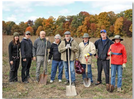
Butternut tree winter preparation, Image 15-2018