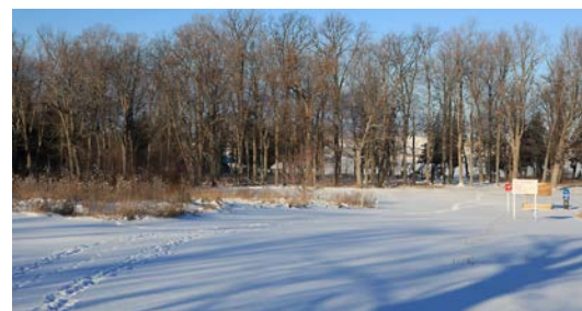
Entrance to Dunes Beach, 16-0576a