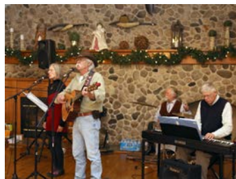
Festival of Trees; Image 15-2104