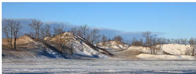
Above: West Lake Dunes, Image 16-0564