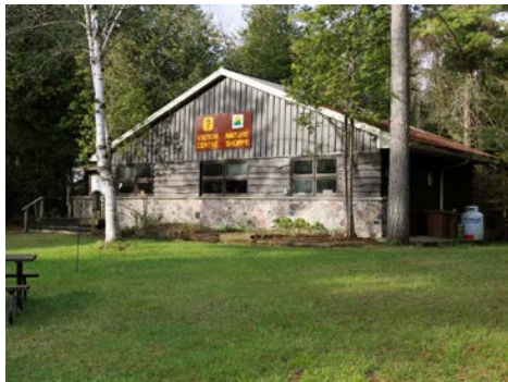
The Visitor Centre/Nature Shop; Image 14-0744