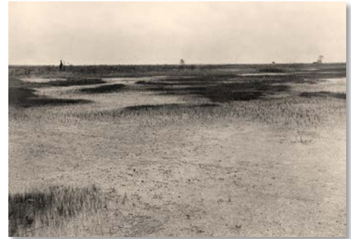
Across the pannes; Image 12-1967