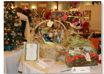
Festival of Trees; Image 15-2075