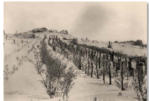
Willow planting; Image 12-1936