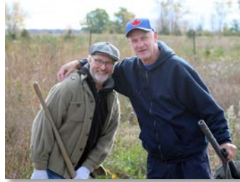
Tree wrapping; Image 15-1986