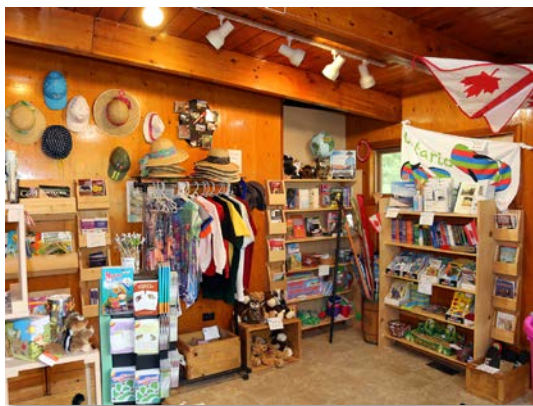
Interior of Nature Shop, Image 13-6514

But our shop needs volunteers to find unique merchandise that will sell, and sell at a fair price, and folks to acquire, price and present it!