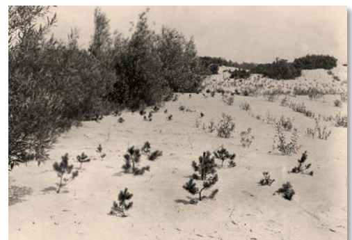
Early pine planting; Image 12-3102

Click on any image to download full-size version.