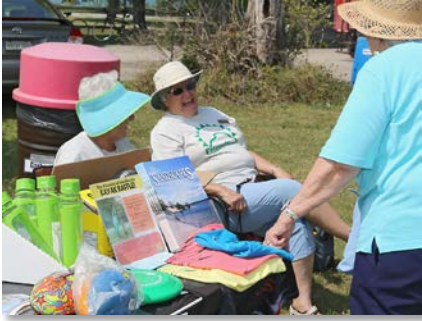
Lakeshore Lodge Days; 15-9824