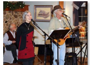
Festival of Trees; Image 15-2073