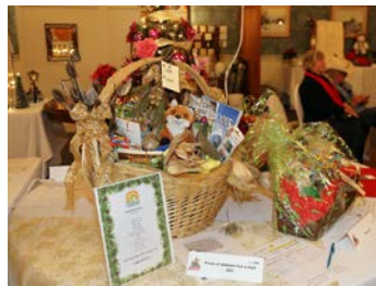
Festival of Trees; Image 15-2079