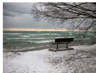
Lakeland Lodge site; Image 16-0551