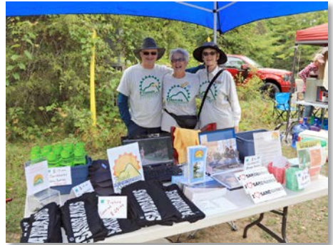
Sandbanks New Waves, 2015; Image 15-0984

The Friends' Nature Shop has been a major source of revenue for us, and enables the Friends to contribute financially to the Park.