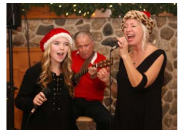
Festival of Trees; Image 15-2188