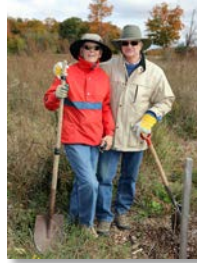
Tree wrapping; Image 15-1999