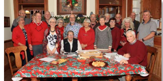
Annual General Meeting 2015; Image 15-2268