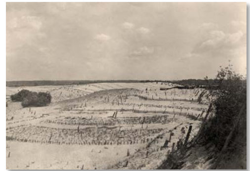
Early snow fencing, wooden fences; Image 12-1982