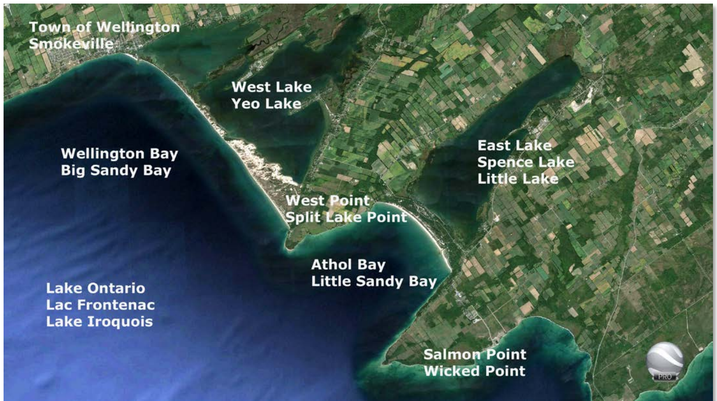
Image 16-0590

A common problem that arises while researching the history of any area is the variety of place names that one encounters. Here are a few from the Sandbanks area... do you know of any others? Please let us know!