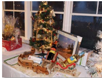
Festival of Trees; Image 15-2068