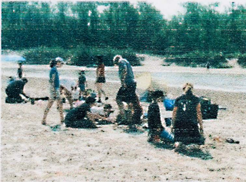
Early group of campers in the planning stages of their sand sculptures