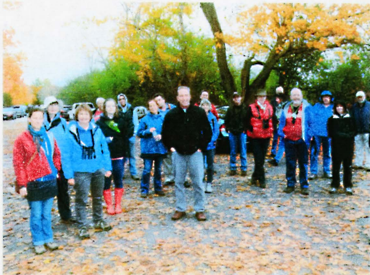
A group of Friends preparing for a hike in the Park last October.