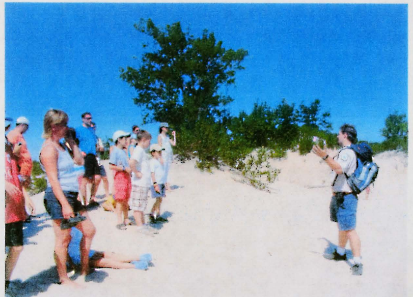
On a guided walk