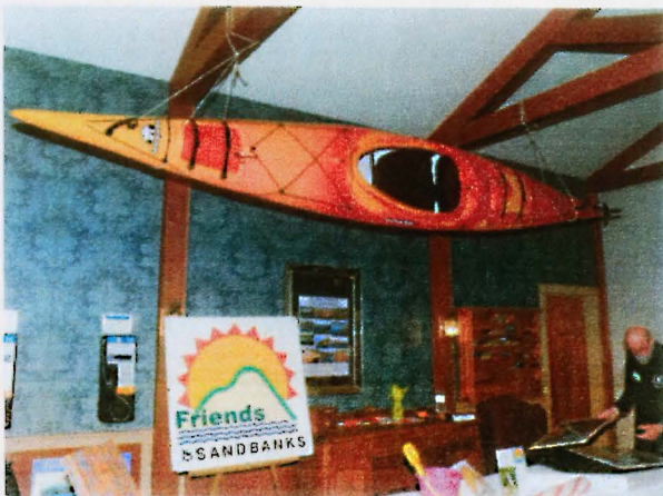
Another wonderful kayak will be raffled this summer. Tickets will be available at the Nature Shoppe.