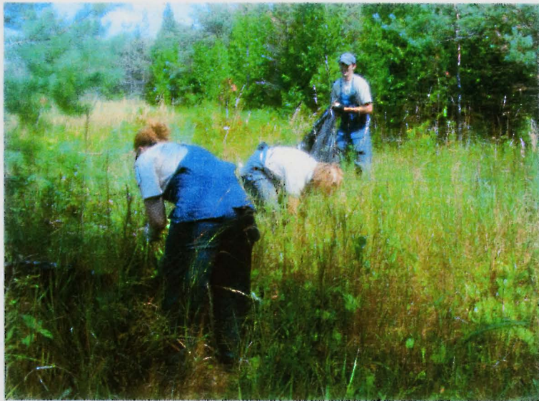
Invasive species removal