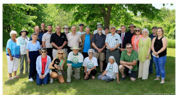
Friends of Sandbanks Park - 25th Anniversary Picnic, June 2018 Working with the Park to make it an even better place to visit