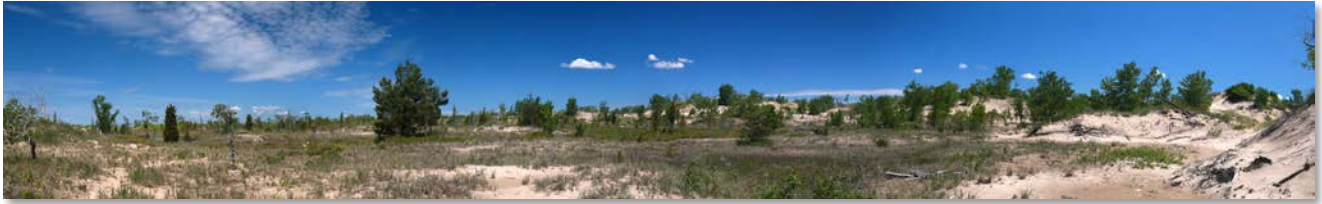
Panoramic view, Image 14-1524