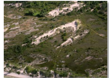
Image 15-9241 Parabolic Dune