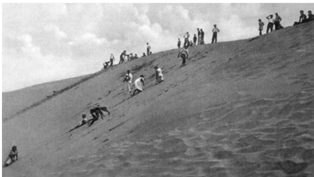
Fun at sandbanks; courtesy PEC Archives; Image 13-6694

"The Sand Banks themselves are deserving of mention in this category. Like the pyramids of Egypt, as you approach them the eye becomes bewildered as you gaze on their vast proportions. For miles along the shores of Lake Ontario, where the storms of medieval ages have been rearing these Sand Banks to an immense height, their appearance, however, are greatly enhanced as you approach them, in consequence of their whiteness glistening in the summer sun, somewhat resembling snow-capped mountains, when seen in the distance. A visit to them never fails to impress the tourist or excursionist with a feeling of pleasurable delight. Like the Toboggan slide in winter, these Banks afford similar amusement in summer, for the lovers of exhilarating exercise and wholesome amusement, especially the young people of both sexes, who climb to the summit, and roll down to their base. The sand is so clean and white that instead of soiling one's clothes, it cleans them beautifully."